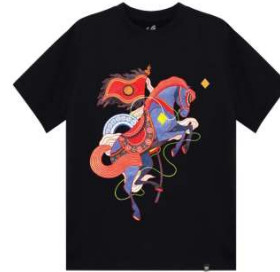
Recommended for T-Shirt & Cap