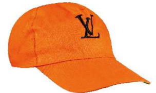
HSW 5G 1632, HSW 5G 2032