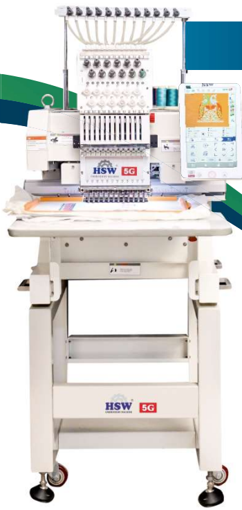
HSW 5G 1216