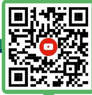
Scan this code for Video