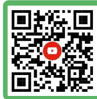
Scan this code for Video HSW 2032