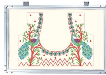
Suitable for Blouse Front in 1 frame