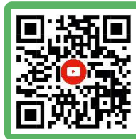
Scan this code for Video HSW 1632